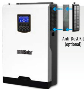
Anti-Dust Kit (optional)